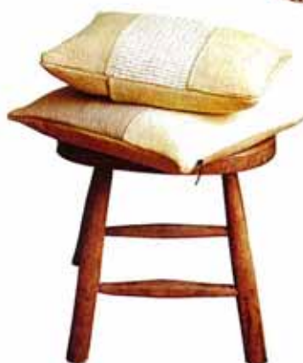
Gilda enjoys natural linens and materials. Home-made raw silk and linen cushions, £26 each, including P&P, Pheasant