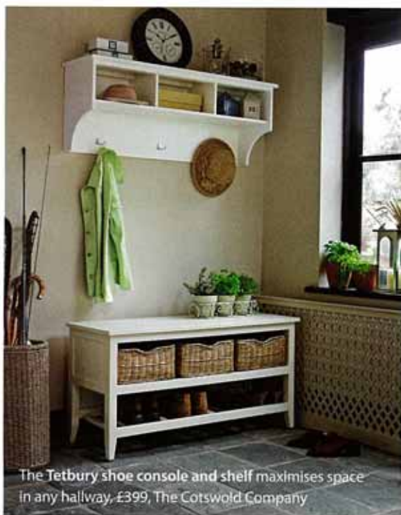
The Tetbury shoe console and shelf maximises space in any hallway, £399, The Cotswold Company