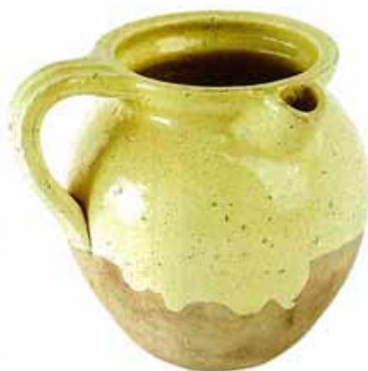
Glazed earthenware left-handed pitcher, £20, Lavender & Sage