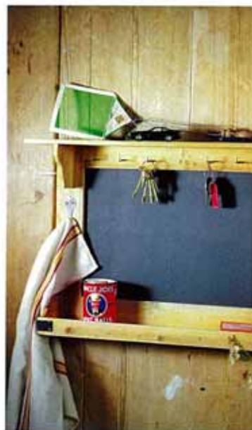
A blackboard in the kitchen always comes in useful. £32, Dibor