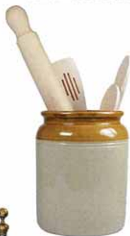
Scottish crock dating between and 1920. £34! The Twice Shop